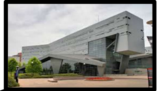
Marian Spencer Hall