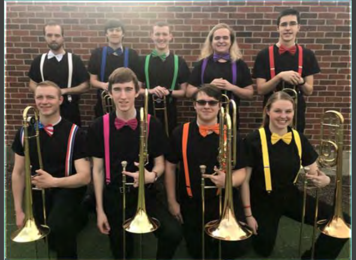
2018 UC Trombone Choir