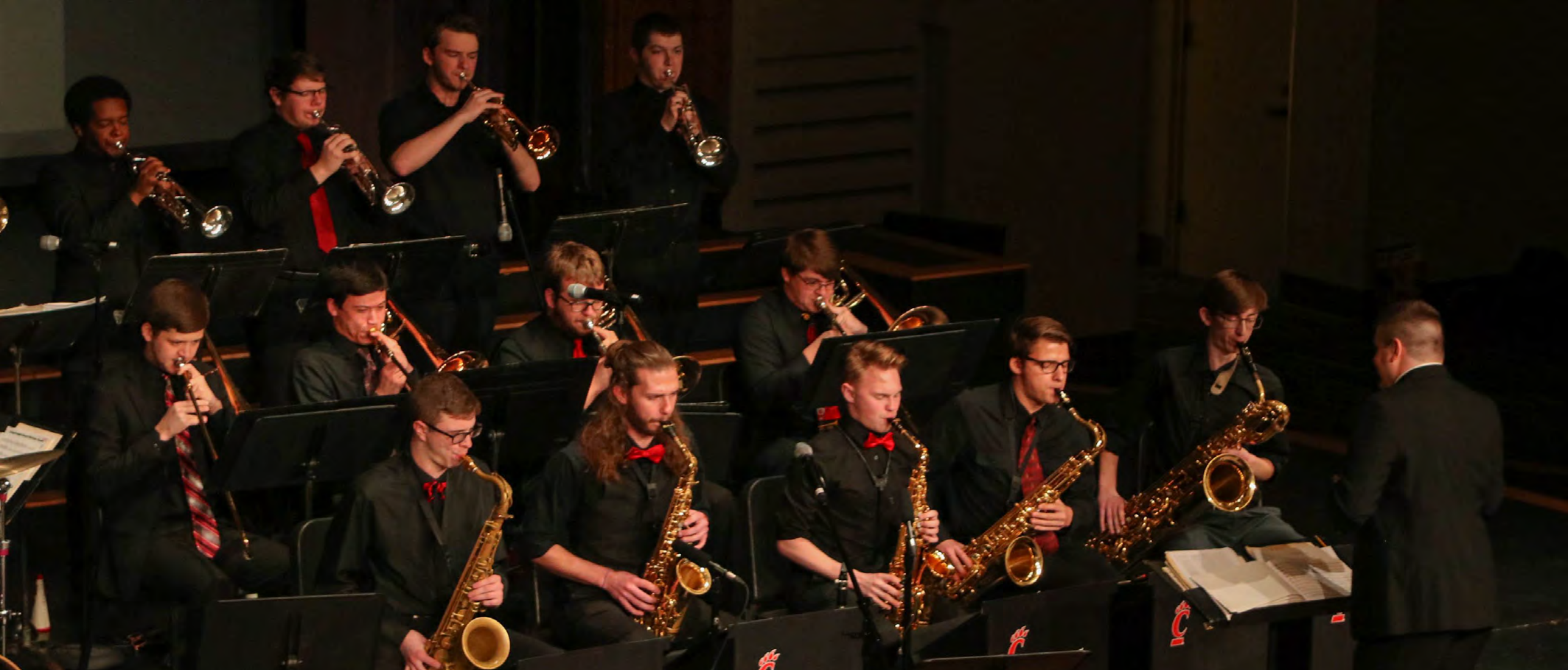
Spring 2018 UC Bearcat Jazz Band