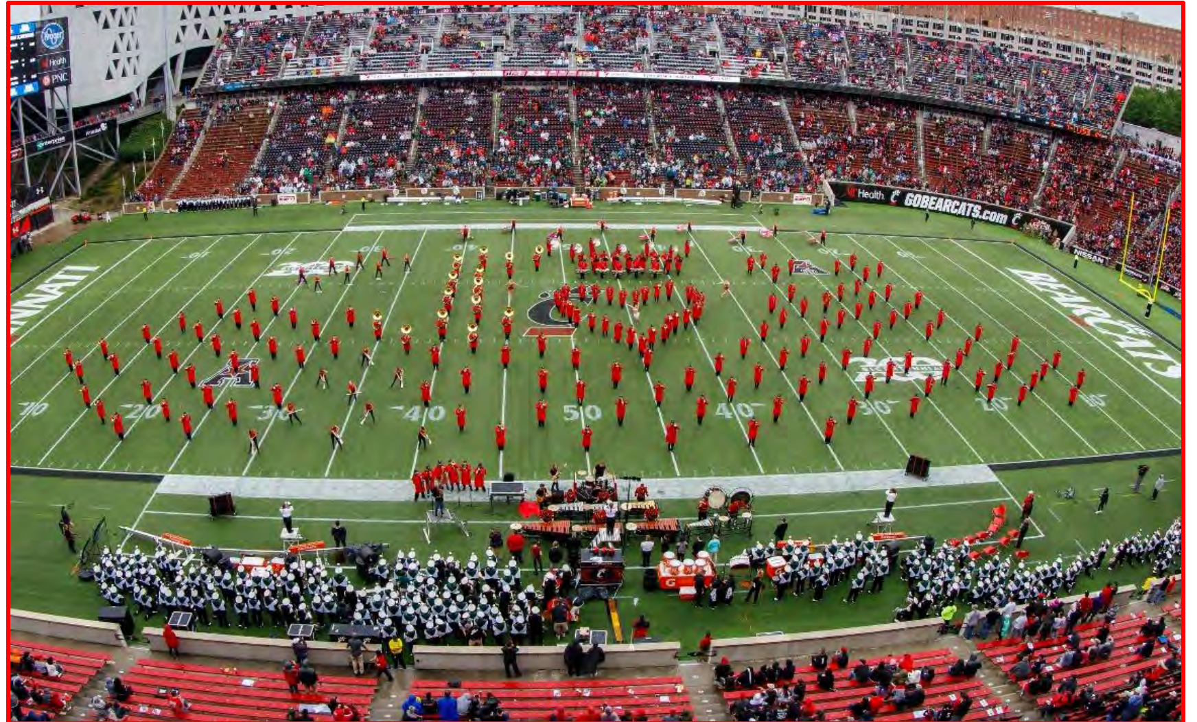
The 2018 UC Marching Band's halftime presentation of Beyonce's "Love on Top."