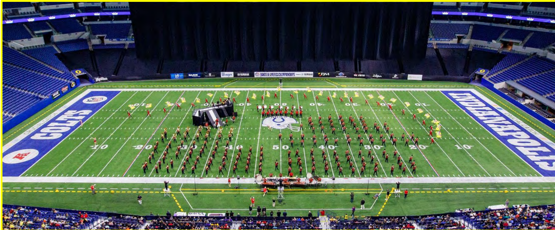
The 2018 UC Marching Band performing at the 2018 BOA Super Regionals in Indianapolis.