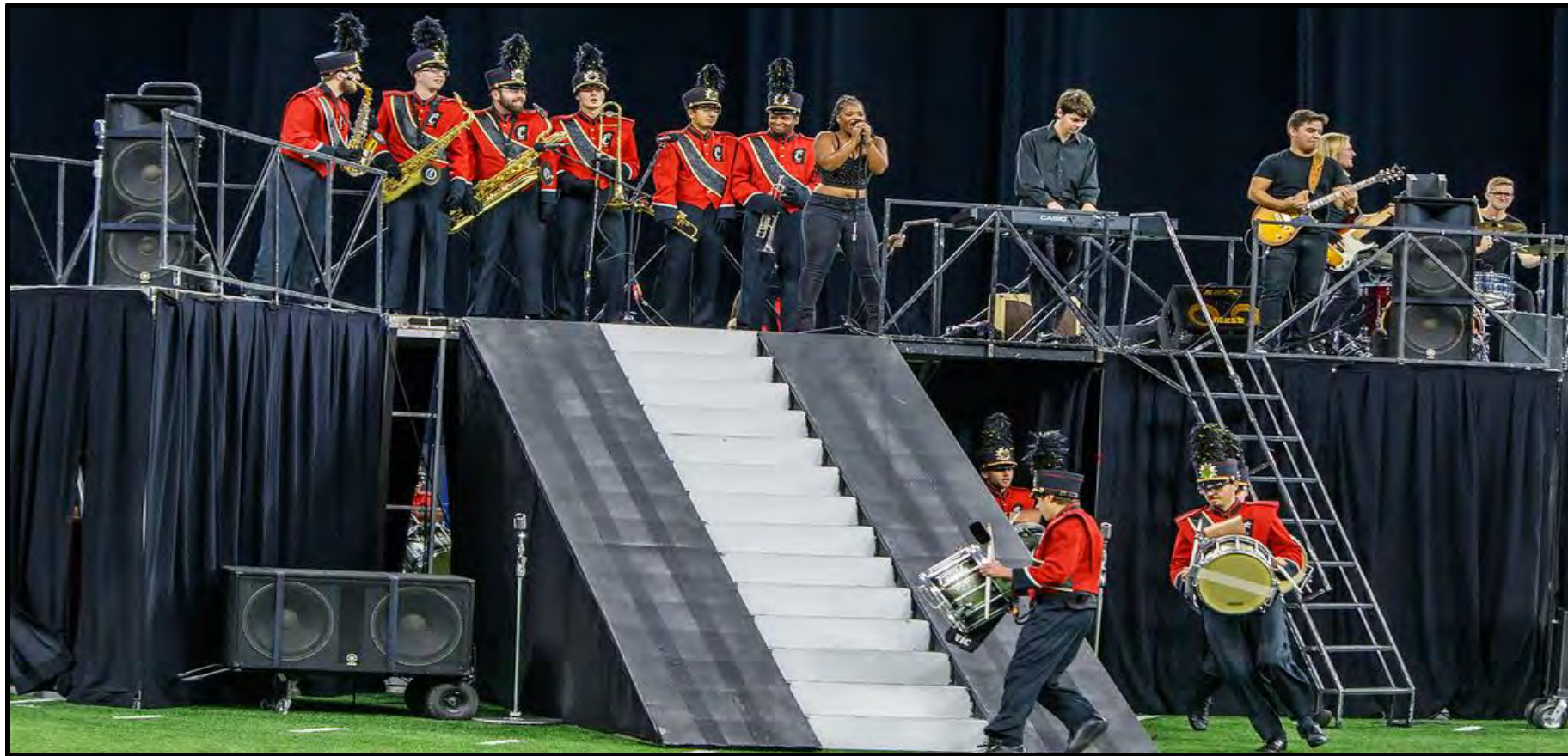
The 2018 UC Marching Band performing at the 2018 BOA Super Regionals in Indianapolis.

The University of Cincinnati requires members to enroll in the class. We allow students from local colleges to join us as well. UC has the only collegiate marching band in the immediate tri-state area which allows students at all neighboring institutions to participate and receive credit through the Greater Cincinnati Collegiate Connection. Go to www.gccollegiateconnection.org for more information.