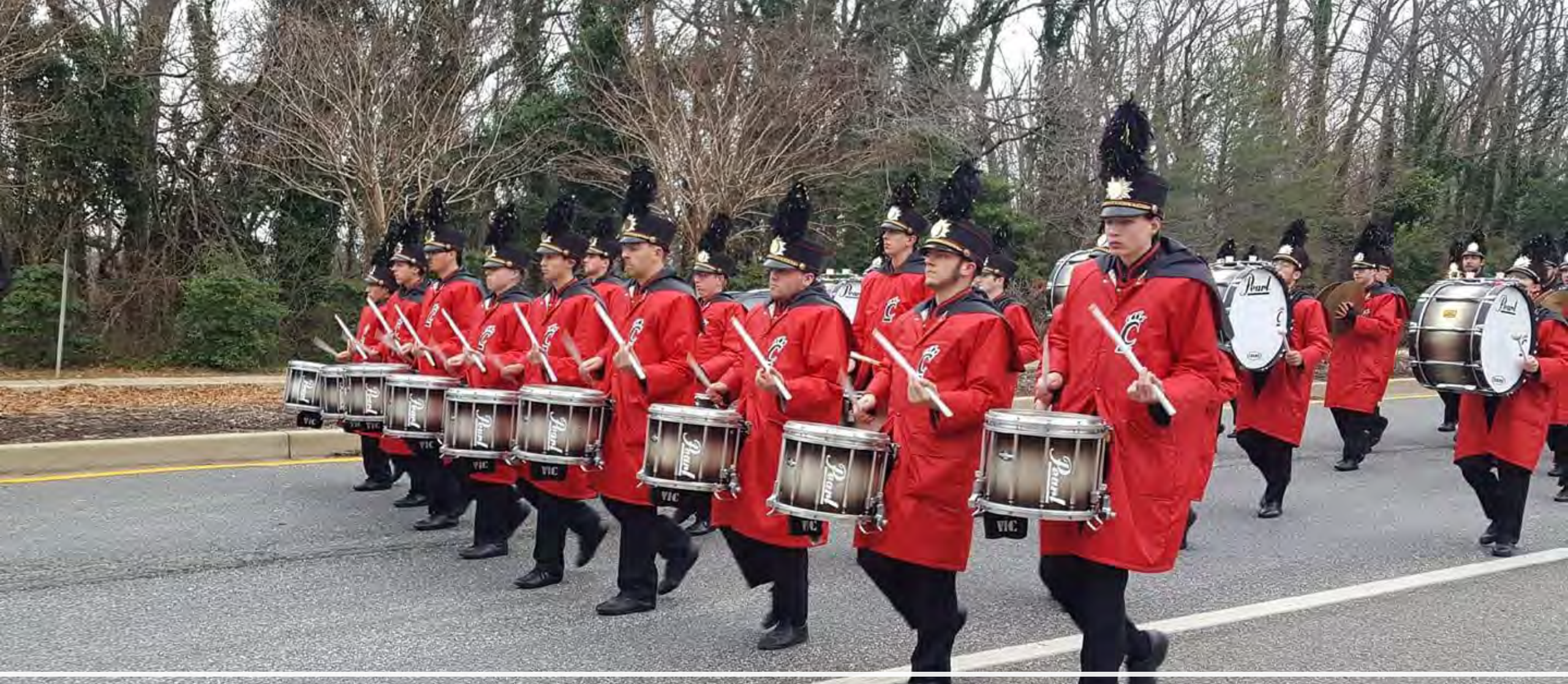
The 2018 UC Drumline marching to the stadium at the Military Bowl in Annapolis, Maryland.