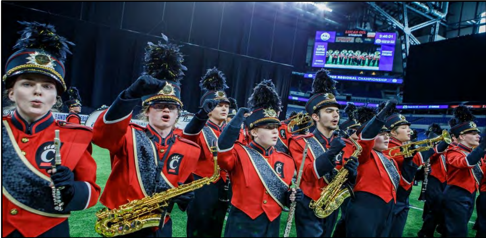
The 2018 UC Marching Band performing at the BOA Super Regionals in Indianapolis.

No. Most of our members are not music majors.