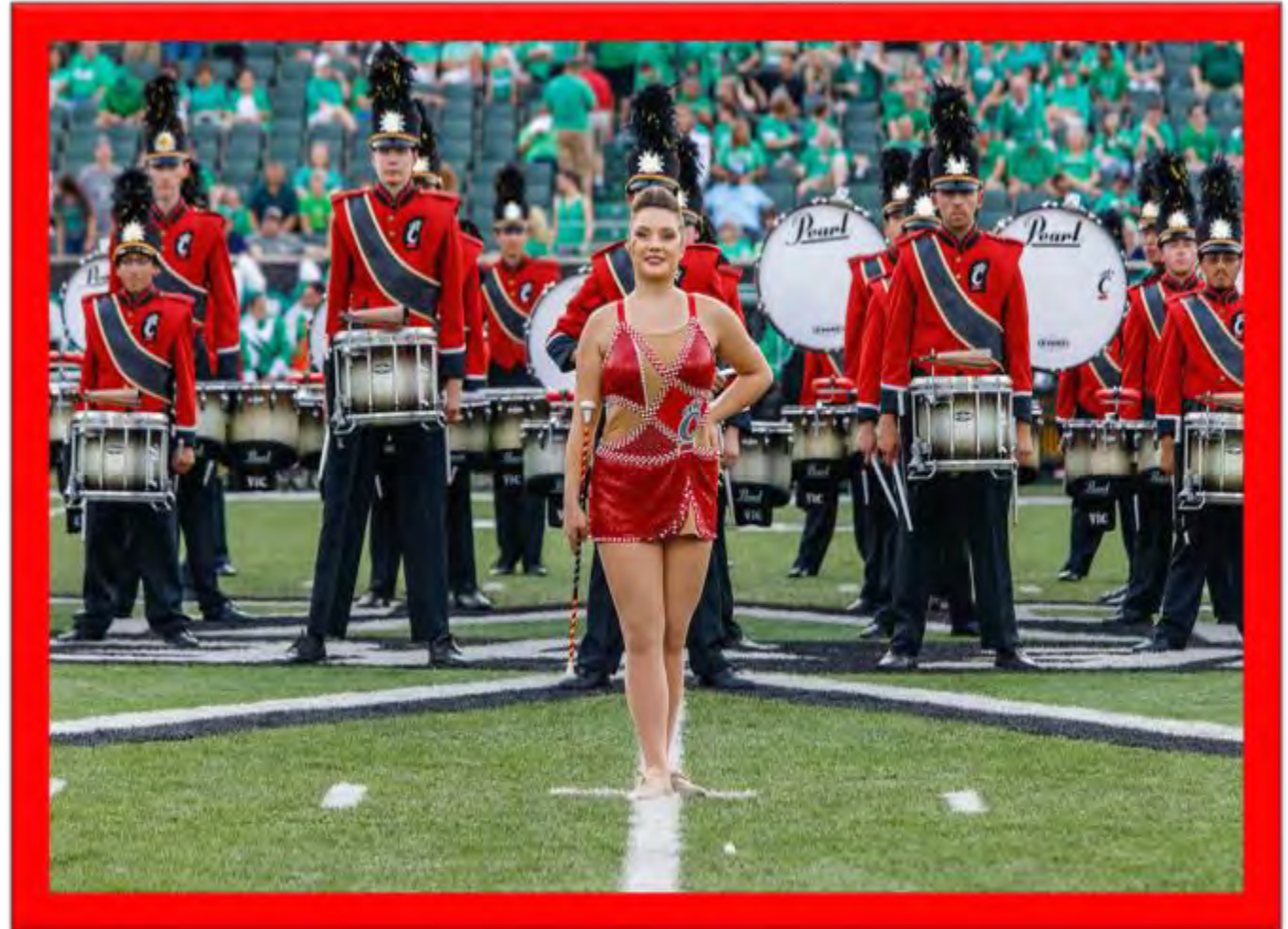
The 2019 UC Marching Band halftime performance at Marshall University.

https://www.uc.edu/campus-life/bearcat-bands/join.html