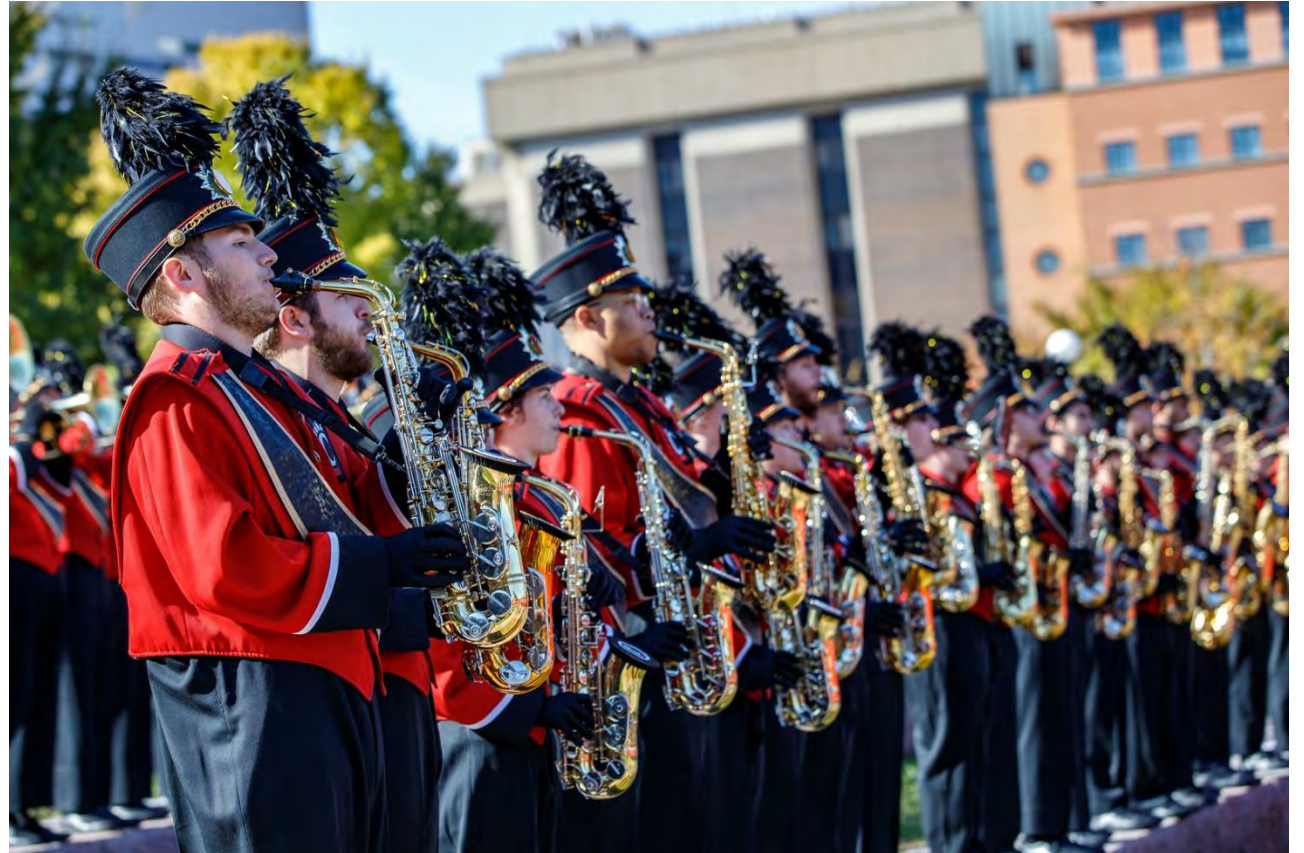
A UC Band pregame concert performance at Sigma Sigma Commons

All participate for the love of the activity and take considerable pride in representing the University of Cincinnati through music. The membership commitment is performing in both the Marching Band and in one of the Basketball Bands. All musicians are expected to continue playing in the spring semester with participation in a concert or jazz band.