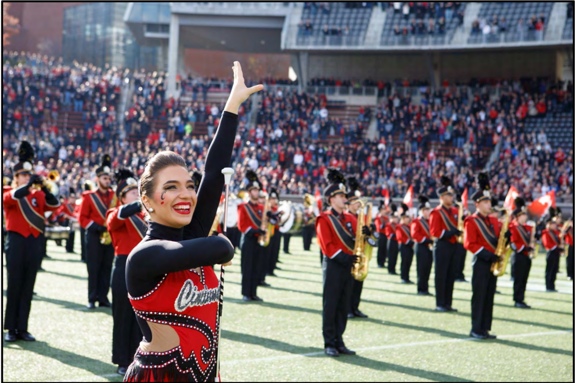
The UC Marching Band performing pregame of a home football game.