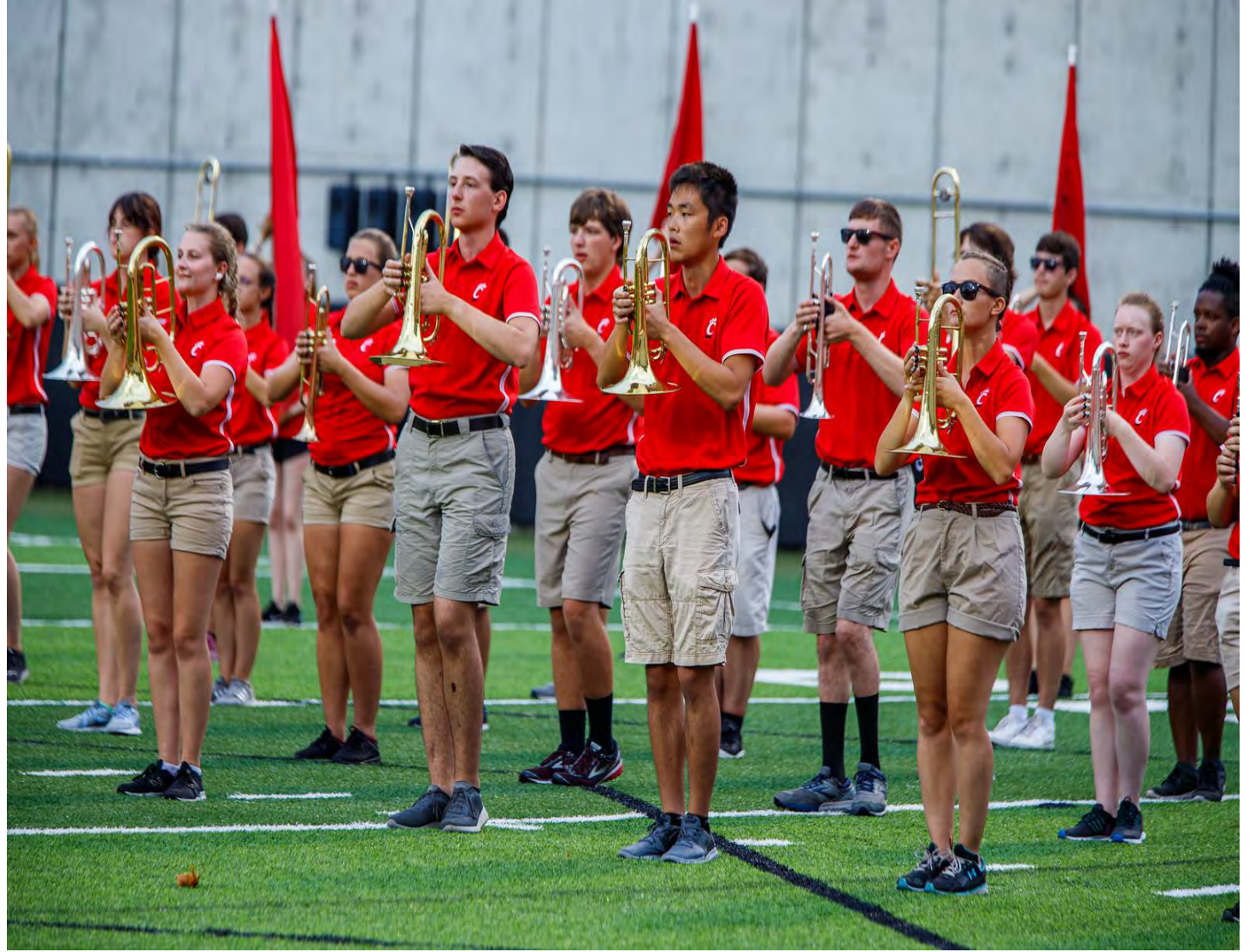
2019 Pre-season Marching Band Preview Show

Please stay alert to any schedule changes due to COVID-19 restrictions.