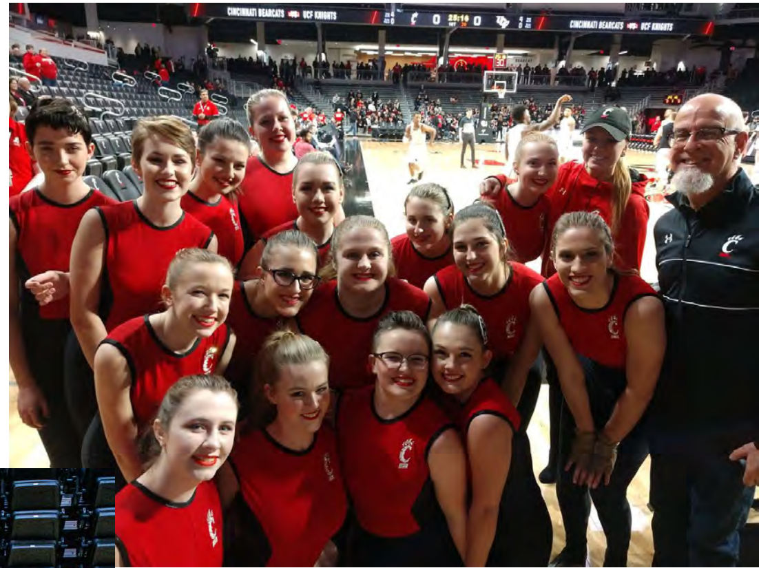
Above: 2020 UC Winter Guard

The UC Marching Band has a contemporary Color Guard section and featured twirlers. Both units require annual auditions.