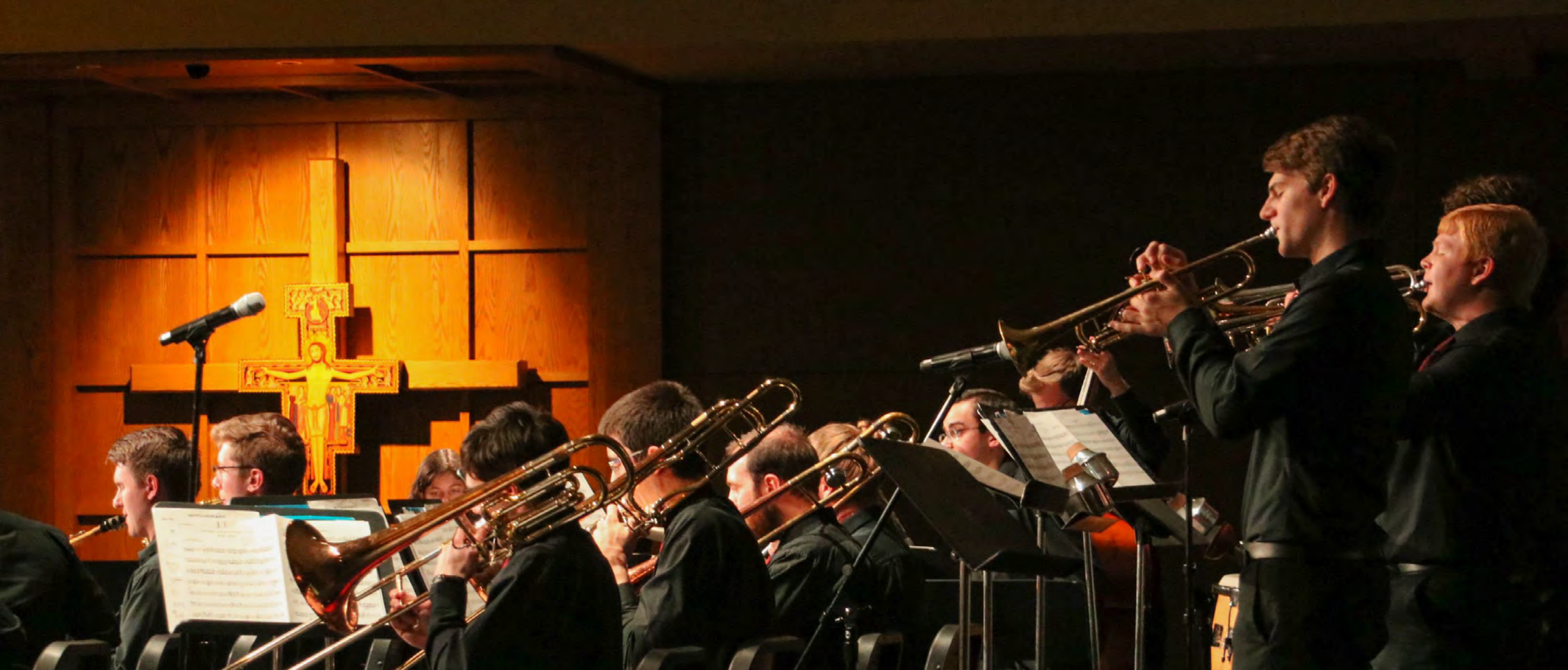
Spring 2018 UC Bearcat Jazz Band